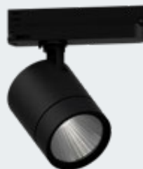
Textured black Matt black RAL 9005 (XX=BL)