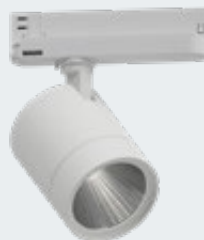
Textured white Matt white RAL 9016 (XX=MW)